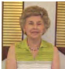
Hendersonville Deanery Chair